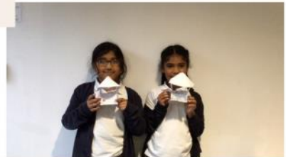
We have made our own round houses which took a lot of patience and precision.