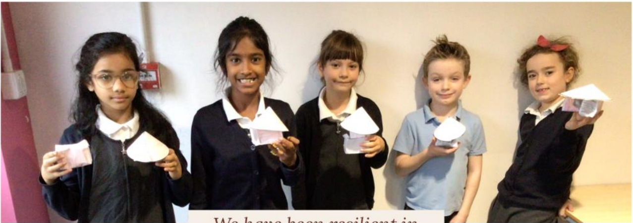
We have been resilient in Maple Class this week.