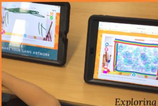
Exploring 'Tate Paint' and creating wonderful art.