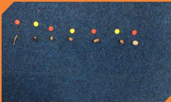
Using counters to represent objects.