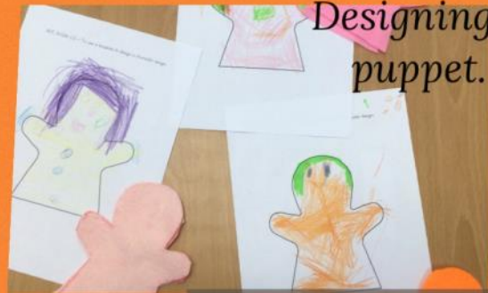
Designing a puppet.