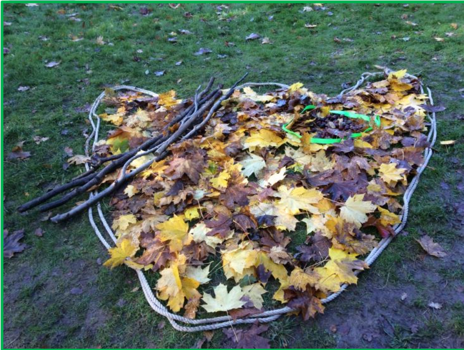
Forest School children made Pudsey Bear!

Pear Class all dressed up for Children in Need