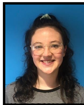
Miss Southern Maple Class